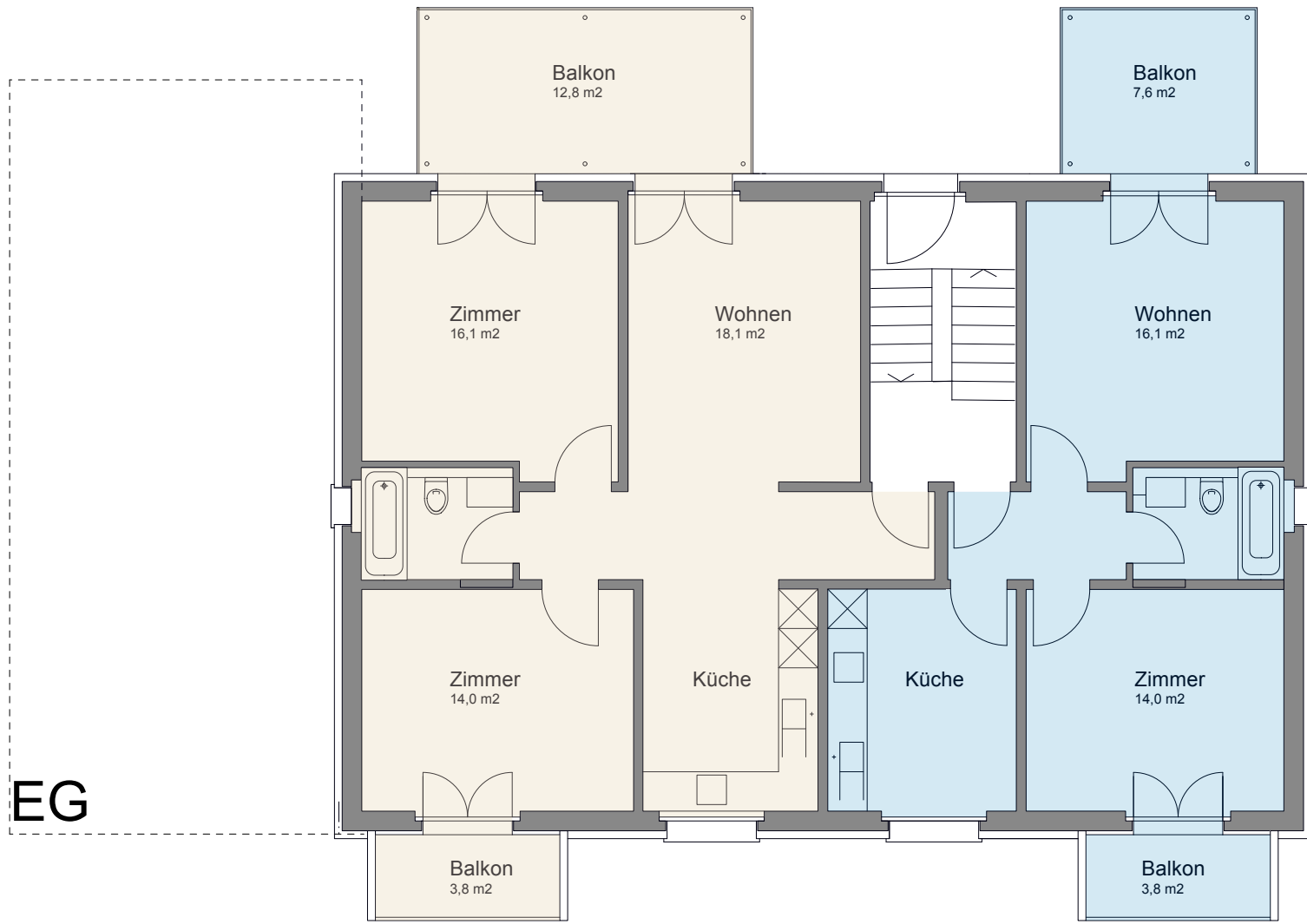
3,5 Zi. Whg. BGF = 78 m 2