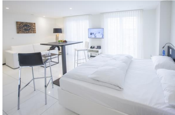
homeCOMFORT-STUDIO without kitchen, with use of loft kitchen, 30 m2