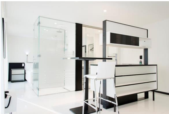
homeAPARTMENT with in-room kitchen, 33-39 m2