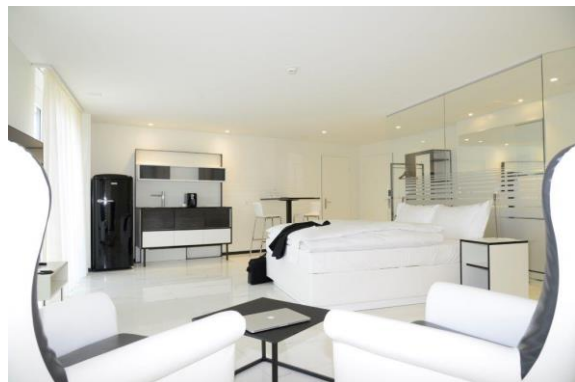
homeSUITE with in-room kitchen, 44-46 m2