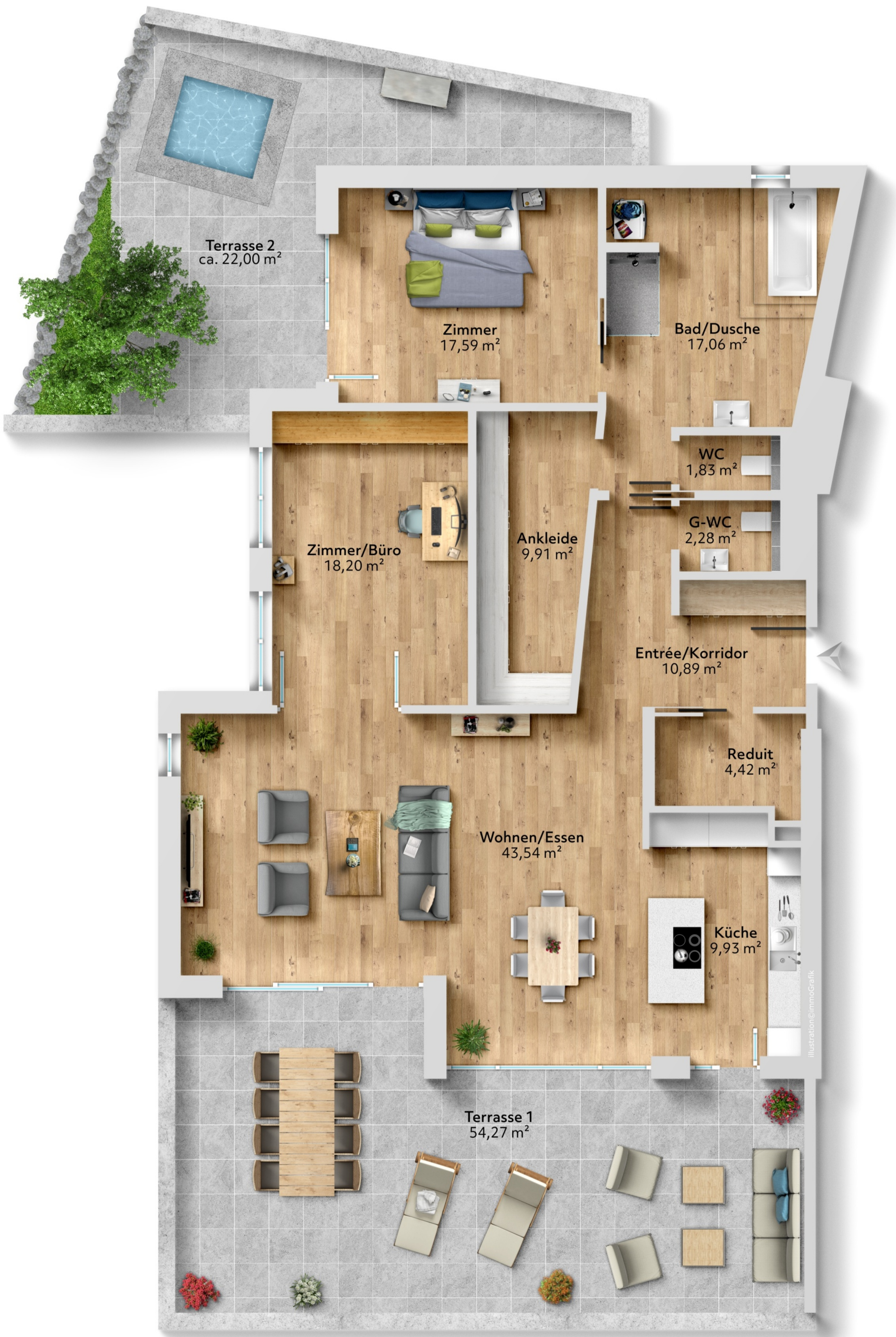
Illustration © ImmoGrafik