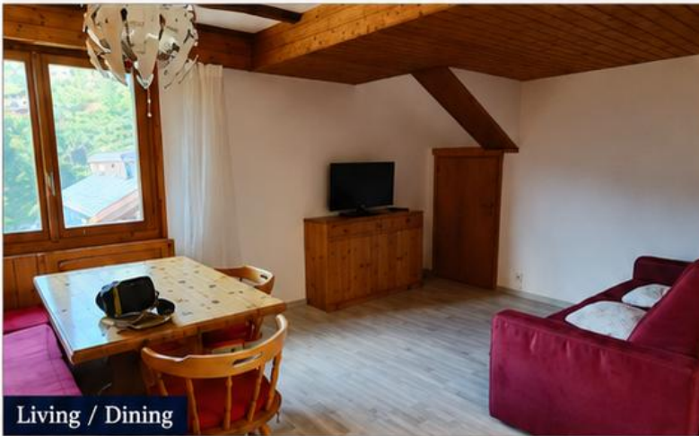
Living / Dining