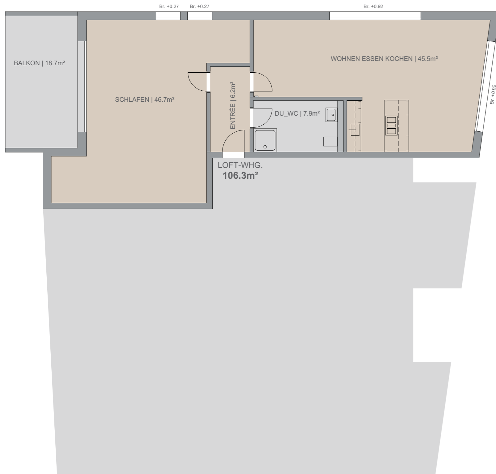
GRUNDRISS LOFT-WHG. 2.+3. OBERGESCHOSS