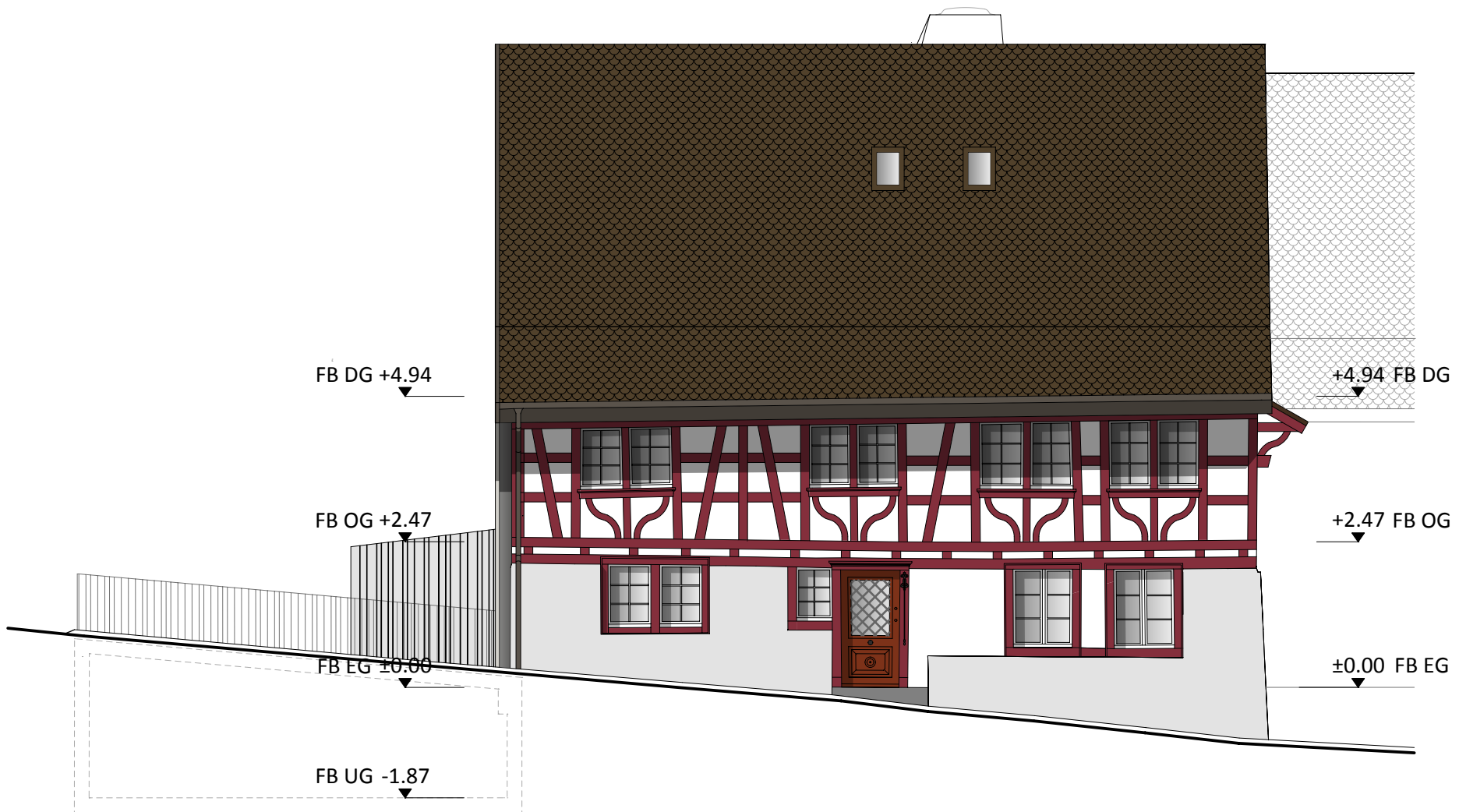
Nordfassade, M 1:100